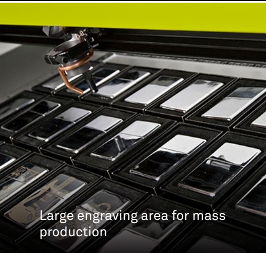
Large engraving area for mass production