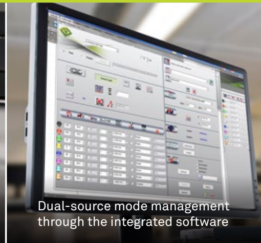
Dual-source mode management through the integrated software