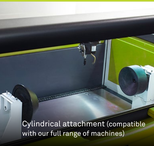
Cylindrical attachment (compatible with our full range of machines)

Deal with any material with the LS900 EDGE! Its Fibre laser source allows stunning results on complex plastics. Its CO2 laser source is especially effective in engraving and cutting organic materials. Start easily one or the other source with the integrated software Gravostyle, through a color code on your file. Automatically switch from one source to the other during the quick engraving process. Engraving area: 610x610mm. Adapted for piece production, small and medium-length job runs.